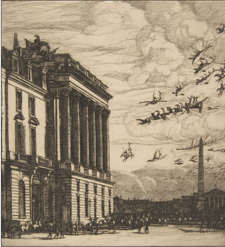
Figure 8. Charles Meryon, The Admiralty, Paris (Le Ministère de la Marine, Paris) , 1865. Etching on laid paper. Metropolitan Museum of Art, New York, Harris Brisbane Dick Fund, 1917.

I begin my consideration of these three versions by acknowledging that Hoar is not the first New Zealand dramatist to grapple with Meryon's compositions and their portent. Qui êtes-vous vraiment M. Meryon? ( Who are you exactly, Mr. Meryon? ), by Pākehā playwright Vincent O'Sullivan, was translated by Christiane Mortelier for the French 1990 Colloquium in Akaroa. The dramatic monologue, performed against a backdrop of projected etchings as Meryon reminisces from his cell in Charenton, traverses the same broad biographical terrain as Pasefika , but the interpretation of the images differs in significant respects. In 1990,