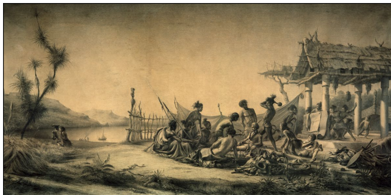
Figure 1. Charles Meryon (1821–1868). Death of Marion du Fresne at the Bay of Islands, New Zealand, 12 June 1772 . Between 1846 and 1848. Crayon, pencil, and chalk on paper with linen backing. Exhibited at the Paris Salon, 1848. Ref: G-824-3. Alexander Turnbull Library, Wellington, New Zealand. Meryon's stylized and exoticized reconstruction of du Fresne's violent demise suggests how prejudicial French myths about Māori, stemming from this event, were alive in Meryon's artistic imagination at this point in his career.

defined by their difference from one another in the French imagination, as indigenous connections were overwritten by the vagaries of foreign encounter. Bougainville's popularly acclaimed Voyage autour du monde (1771) extolled Tahiti as an earthly paradise populated with beautiful, innocent, and carefree inhabitants, lending credence to the theories of Rousseau and Diderot. New Zealand, on the other hand, became subject to another myth, depicted as a fearsome place of warriors and cannibals, an impression reinforced by the murder and consumption of French explorer Marc-Joseph Marion Du Fresne and twenty-six of his officers and men in the Bay of Islands in 1772 (figure 1). Even though the initial French reprisal left 250 Māori dead, early writers tended to ignore the European role in this tragedy, and it influenced French opinions for a long time (Dunmore, "The First Contacts" 13–16). As Christiane Mortelier affirms, whereas more balanced accounts did exist, French discourse emphasized the "New Zealand-Tahiti opposition," dichotomizing "Ignoble Barbarians" and "Noble Savages" in travelogues, treatises, and material culture, and reinforcing an ethnic and moral cartography that persisted well into the nineteenth century (166; Collins "Maori" 155–56) (figure 2).