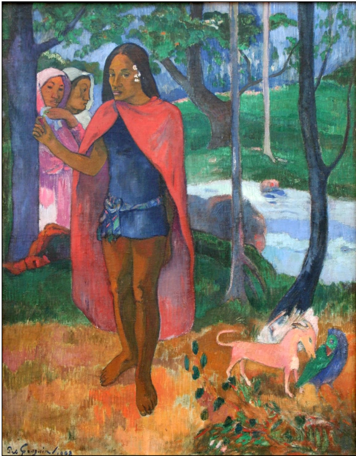
Figure 3. Paul Gauguin, L'Enchanteur, ou Le sorcier de Hiva Oa , 1902. Oil on canvas.

rated past, the numinous, dreams, and inscrutable signs, Pambrun's play prompts us to push the notion of theatrical dark matter beyond Sofer's postclassical western dramatic purview to consider its possibilities for indigenous performance; in this instance, how those things that do not give themselves up to general observation yet are nonetheless palpable and perceptible become important in recuperating a history of cultural loss in the theatrical and social present.