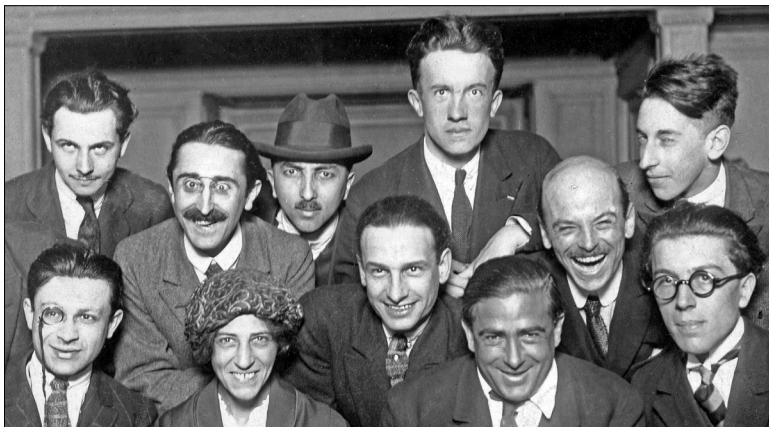
Photographie inconnu, 1921

édita sa propre revue, Projecteur (un seul numéro paru, en mai 1920). Sa place et son rôle était suffisamment reconnus à l'époque pour qu'elle ait été placée entre Tzara et Picabia sur la photo du groupe Dada prise en 1921.