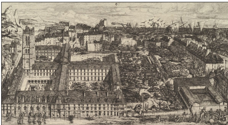
Figure 7. Charles Meryon, Collège Henri IV (ou Lycée Napoléon) , 1863–64. Etching on laid paper, fifth state of eleven. Metropolitan Museum of Art, New York, Anonymous gift, 1917.

open the issue of how we might meet the challenge of the Pacific, on what terms we might be swept up, and how different peoples might participate in this oceanic imaginary.