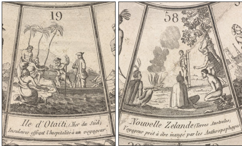
Figure 2. Basset, Jeu Instructif des Peuples et Costumes des Quatre Parties du Monde et des Terres Australes (Instructive game of the peoples and costumes of the four parts of the world and of the southern lands), 1815. Detail. This nineteenth-century version of the Game of the Goose ( jeu de l'oie ) had players roll dice to complete a spiral journey around the world, from China to France, along 63 consecutively numbered spaces. Players landing on Tahiti (space 19, traditionally represented by an inn) were waylaid for two turns by the hospitality and amorous wiles of the friendly natives, pictured here as proffering breadfruit and breasts with classical grace beside a languid, palm-fringed lagoon. Players landing in New Zealand (space 58, conventionally indicating death) were the feast—the image depicts a despondent European tied to a stake before a fire as a Māori man advances to clobber the captive with his patu —and had to return to the beginning.

France's nineteenth-century colonial ambitions sought to suture both sites into one geostrategic entity. As Peter Tremewan has explained, the French came extremely close to colonizing southern New Zealand: "If it were not for a few delays in the implementation of French plans, New Zealand could have had a British North Island and a French South Island" (13). 2 After acquiring Banks Peninsula (on the South Island's east